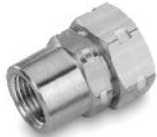
STRAIGHT FEMALE FITTING