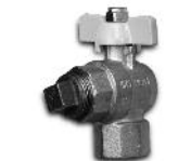
90 DEGREE BALL VALVE