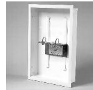
GAS LOAD CENTER