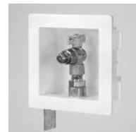
XR3 OUTLET BOX