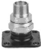
TERMINATION FITTING WITH SQUARE FLANGE

Upon ordering, all broken box quantities are subject to a 10% premium except the 1-1/2" and 2" products.