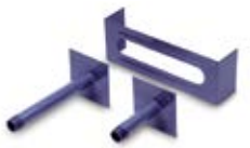
Straight Stubs & Stub Bracket