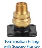
Termination Fitting with Square Flange