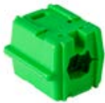
Jacket Stripping Tool