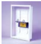
Gas Load Center