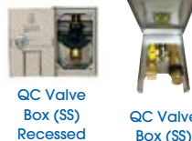
QC Valve Box (SS) Recessed QC Valve Box (SS)