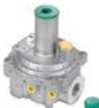
Pietro Fiorentini Regulators

*Natural gas, 0.60 specific gravity. 1 PSI inlet, 8" w.c. outlet See Gastite®/FlashShield+™ Design & Installation Guide, table 4-7 for further sizing info.