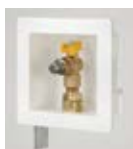
XR3 Outlet Box