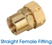
Straight Female Fitting