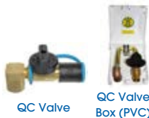
QC Valve QC Valve Box (PVC)

*Capacity of flex connector and QC valve combination, @ 1" w.c. pressure drop