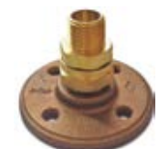
Termination Fitting with Bronze Flange